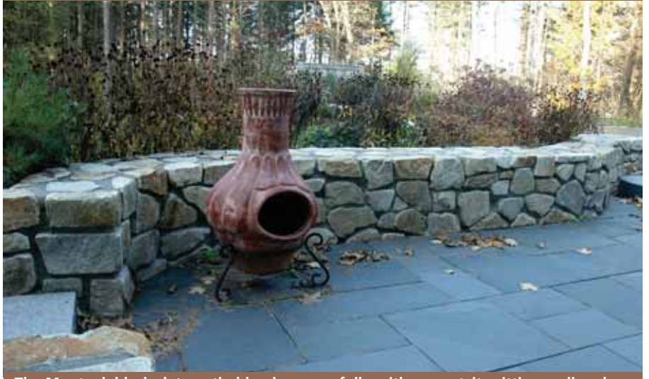
The Montauk black slate patio blends successfully with a quartzite sitting wall and granite step, creating a stunning sitting area.

hard features that, once incorporated, provide function to the landscape.