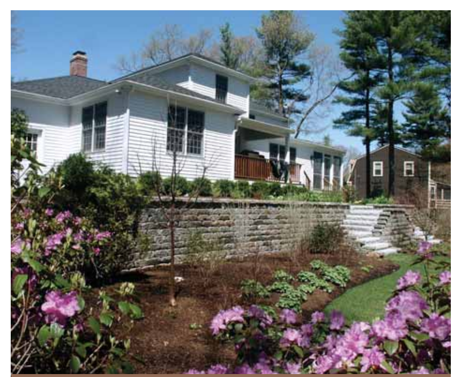
This segmented retaining wall was installed to replace a failing railroad tie wall. Granite switchback steps with paver landings were used to break up the steep grade change.